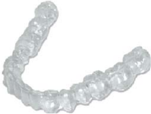
Figure 1. Clear, full-coverage aligner

Functional appliances are used to influence and alter the positioning of the patient's hard tissues (teeth, alveolar bone and jaw positions) by altering the patient's function. These may be fixed or removable. Examples of functional appliances include the Herbst, which is fixed and therefore does not require patient compliance for wear; the bionator and Frankel appliances, which are removable.