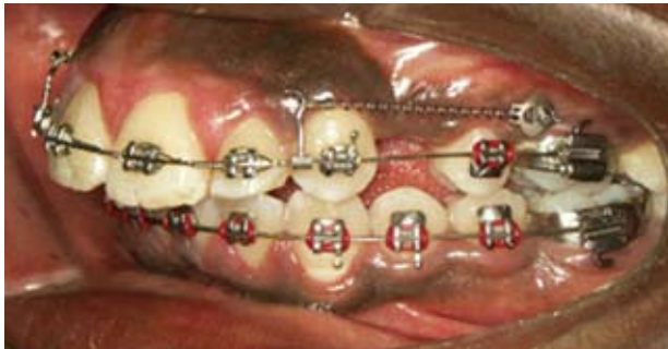
Figure 4. Temporary anchorage device and FOA

The use of temporary anchorage devices (TADs), also known as mini-implants or mini orthodontic screws, can speed up orthodontic treatment in some cases. 33,34 TADs produce absolute skeletal anchorage and have been used successfully to treat cases of varying degrees of complexity. Care is required during their placement to ensure they are correctly positioned and to avoid iatrogenic damage associated with impingement of a TAD on a nerve, root surface or the periodontal ligament. Extra care is also required by the patient to maintain oral hygiene around the TAD to avoid infection at the site of placement. 35,36