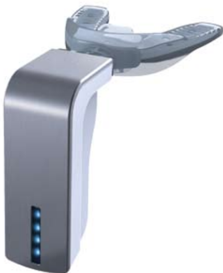
Figure 5. AcceleDent device

One portion of the device is a mouthpiece similar to a sports mouthpiece, which the patient bites onto during use. The mouthpiece portion is connected to another piece that stays outside the mouth; this portion (activator) houses the components that provide the cyclic forces (vibration). The activator includes a battery, motor, rotating weights and micro-processor for storing usage data. The patient connects the mouthpiece to the activator and uses the device once daily for 20 minutes. The applied force from the device is at 0.2 N (20 grams). This low force is intended to be barely noticeable and not uncomfortable. The device can be used with all FOAs as well as clear resin aligners (Invisalign). The activator is placed in a docking station between uses to both recharge the activator and show compliance data.