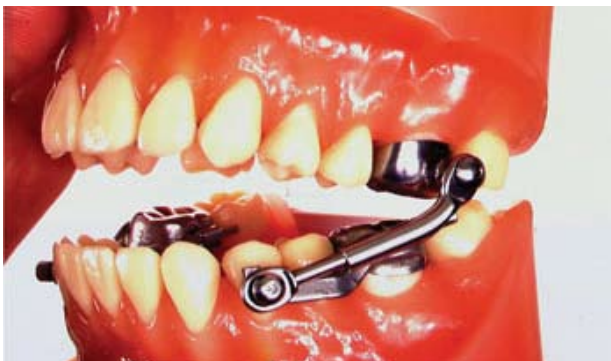
Figure 2. Functional appliance (Herbst)

Fixed orthodontic appliances are used for the majority of orthodontic cases. Modern fixed orthodontic appliances have their genesis in Angle's ribbon arch technique, which was introduced in the early 20th century. The ribbon arch technique utilized a curved archwire with friction sleeve nuts and threaded ends, and bands with lockpins cemented on the teeth. This appliance was the first that could achieve controlled three-axis tooth movement. 4 The ribbon arch technique was subsequently replaced by the Edgewise technique in the 1920s. Over time, nickel-silver bands and archwires superseded gold-platinum, and were later replaced by stainless